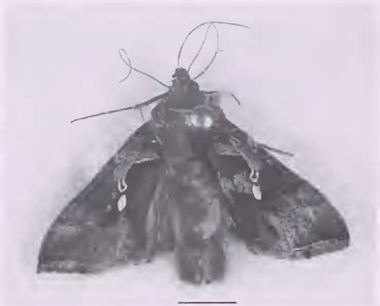
Figure 2. Adult male moth of Chrysodeixis eriosema showing the scale tufts on the abdomen.

( Lycopersicon : Solanaceae). C. eriosoma (Dbl.) occurs throughout much of the oriental and asian regions, including the islands of the south Pacific as far east as Easter Island. It is known throughout northern and eastern Australia. In Australia it is mainly a pest of vegetables and garden ornamentals including bean ( Phaseolus : Fabaceae), tomato ( Lycopersicon : Solanaceae), mint ( Mentha ), Coleus (both Lamiaceae),